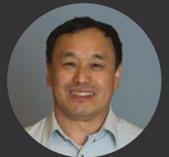
ALFRED DEAKIN PROFESSOR IAN CHEN INSTITUTE FOR FRONTIER MATERIALS

double the temperatures (up to 800° C). This superior heat tolerance is critical for the 3D printing process for metal matrix composites.”